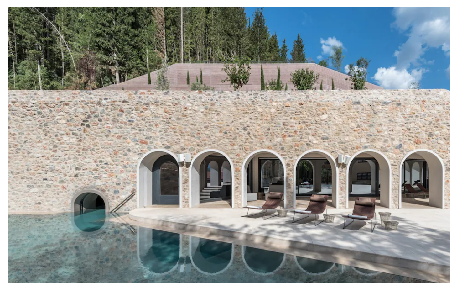
A slice of heaven (amongst the pain): the outdoor pool at Euphoria Retreat

Her interest in relaxation and recovery means there is a gentler element to my Spartan programme. Over the course of my stay, my weary muscles are pressed and persuaded via a series of treatments. There is a deep tissue massage which locates sinews and ligaments I wasn't aware I possessed, and charms them into a better mood. There is a meditation session which almost sends me floating to another plane; a soft-soaping hammam ritual that has a near-identical effect. And at the end of every day, there is a return to a room whose bed, a cloud of pillows and duvet, is the type you might sink into, and keep falling.