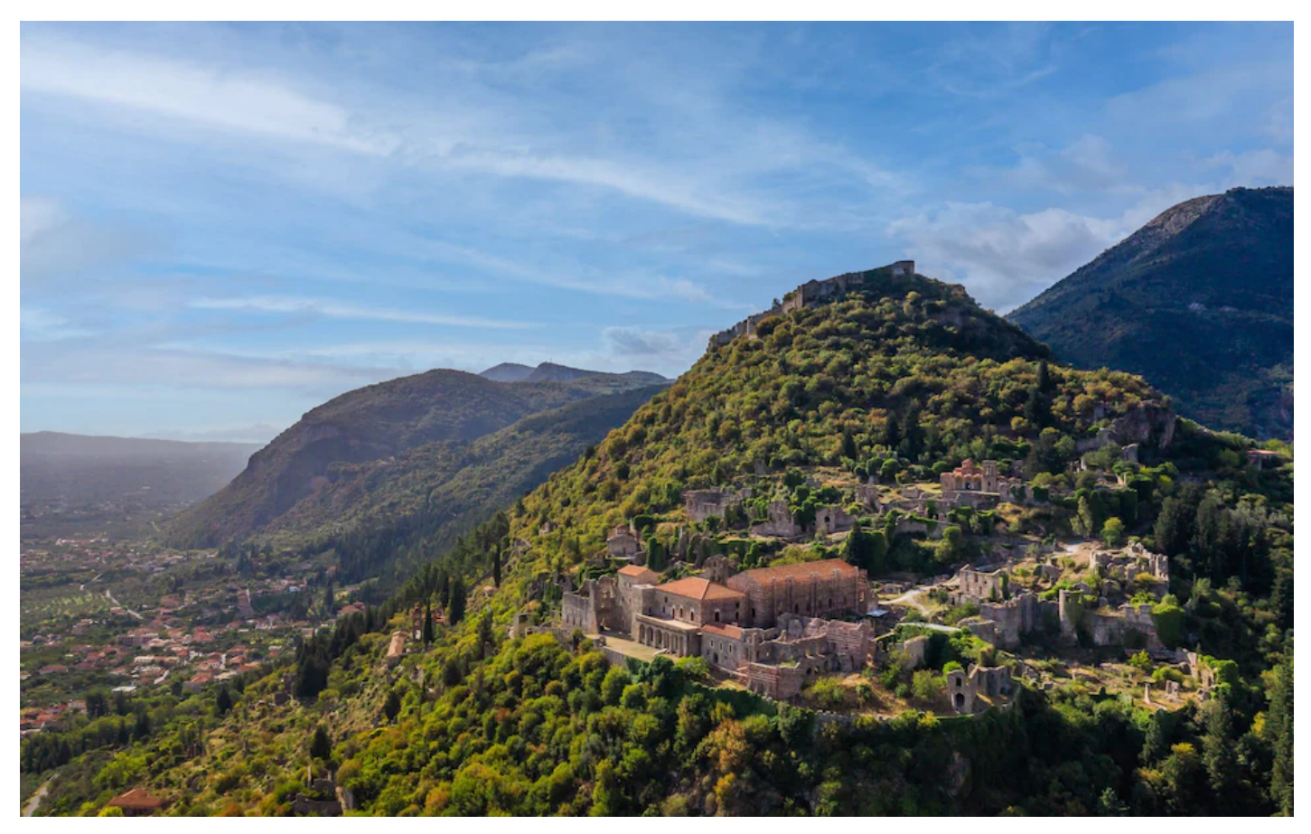
Euphoria retreat, snuggled into the Greek mountains

It is indeed lovely; a snapshot of pastoral Greece so wonderful that Zeus might have used it as a backdrop for selfies. Directly ahead and to the east, the Parnon mountains raise their shoulders. Sparti sits resplendent underneath, on the valley floor, swaddled in mist or bathed in sunlight, according to the time of day. The Taygetus range picks up the thread immediately behind, its titular peak holding a sacred place in the Greek psyche, its top crowned by a chapel to the Orthodox Profitis Ilias (the Old Testament prophet Elijah).