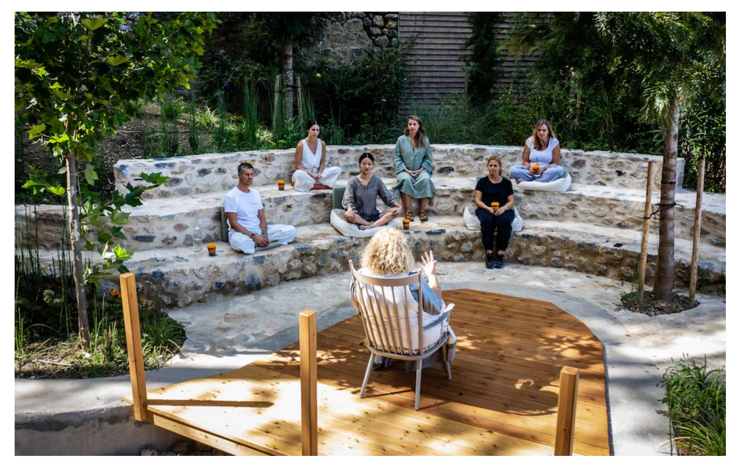
Retreat guests gathered, it's a smart, grown-up European crowd

All of this is far more in keeping with the key demographic at Euphoria. The majority of my fellow guests are aged 40 and up; smart, well-spoken travellers from various corners of Europe – a smattering of French conversation here, a dash of chatter in German there – all keen to shed their everyday concerns for a week. We gather every lunchtime and evening – at individual tables – at Gaia, the house restaurant, where the fare is healthy, but surprisingly filling. These are not diet rations. There are Greek cheeses, lightly grilled steaks, baskets of fresh-baked bread. Everyone tucks in. The only restraint is on booze. Alcohol is not strictly forbidden, but it is not offered with dinner, and I do not see anyone approach the little bar in the corner of the lobby. It would be some sort of walk of shame.