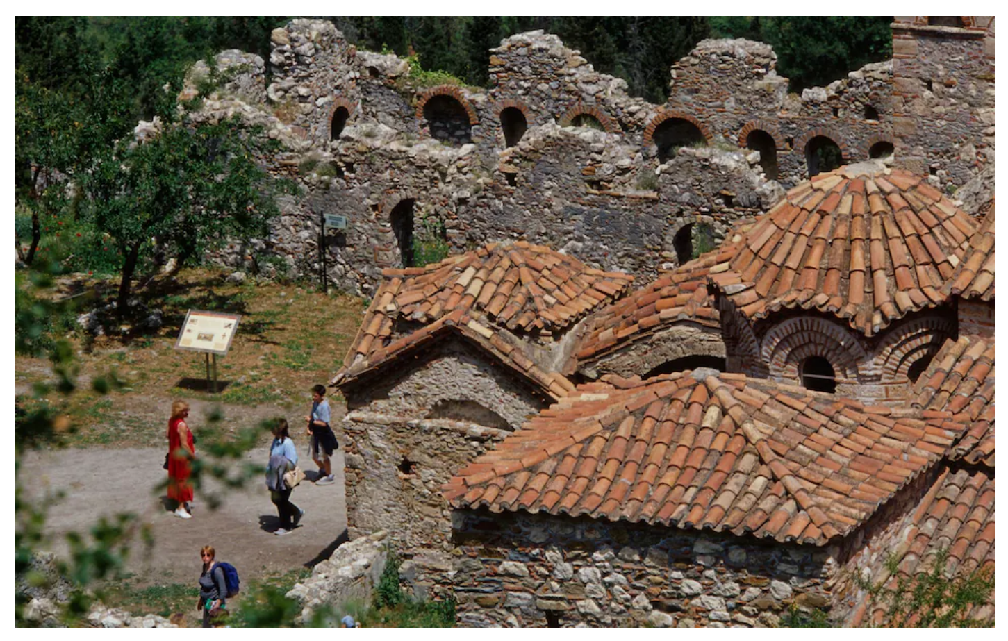
The ruined city of Mystras

on the hard flank of Mount Taygus - believed they had arrived at ancient Sparta. This towering mixture of battlements, churches and houses has the look and feel of a place which might have existed in the deepest annals of history.